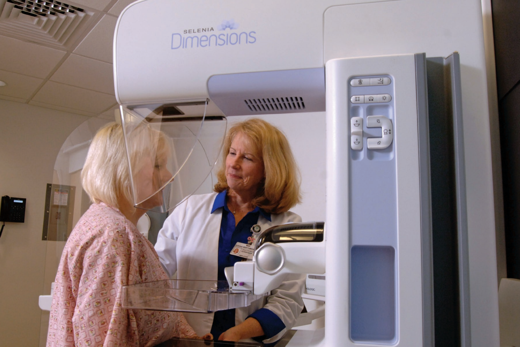
State-of-the-art 3D mammography machine